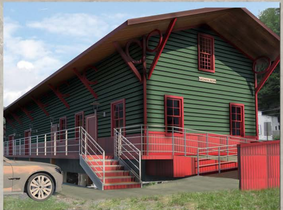
PROPOSED EXTERIOR RENDERING