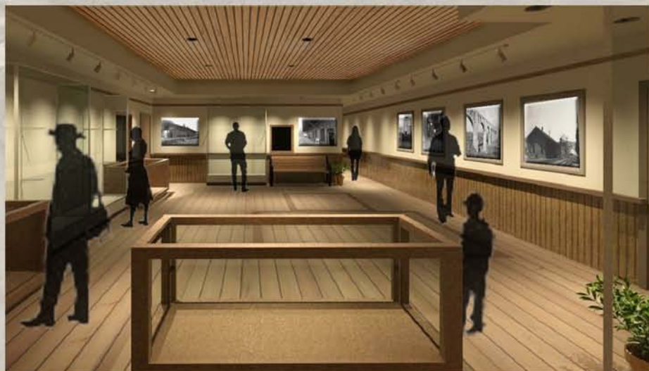
RENDERING OF PROPOSED INTERIOR EXHIBIT SPACE