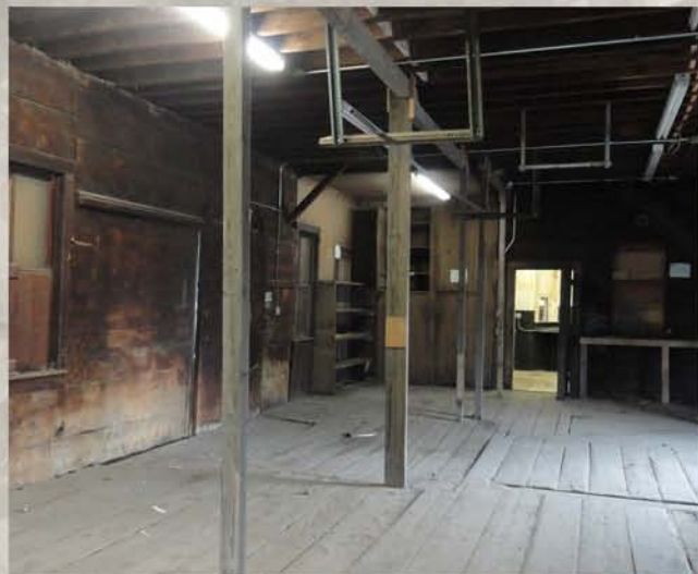
EXISTING CONDITION OF INTERIOR