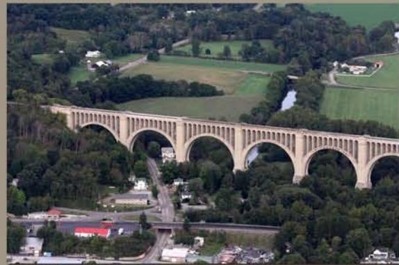
Aerial View of Nicholson

People in Nicholson see this as their symbolic town center. Properly renovating the 1849 building into a Visitors Center, as well as a place for community events, will ensure it is available to welcome visitors & residents for another one hundred and fifty years.