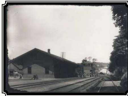
Station - Turn of the 20th Century

The Nicholson Heritage Association is raising funds to purchase and renovate the former Delaware, Lackawanna and Western Railroad's (DL&W) Nicholson Station, located right off Route 11. This landmark has been a virtually unchanged fixture for more than 160 years.