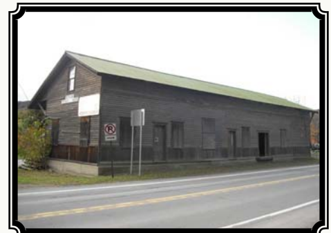
Station - 2009

We hope you will consider donating to this cause. Thank you for your support!