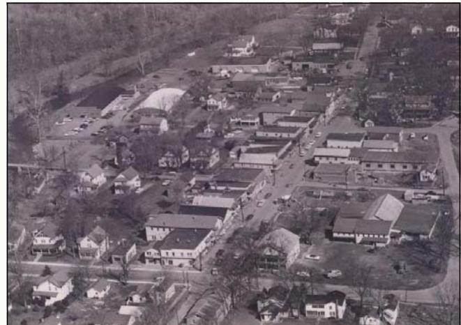
Main Street – Nicholson, PA

Nicholson Bridge Day has been held every year since the Nicholson Bridge 75th anniversary celebration, organized by the Nicholson Heritage Association, in 1999. The Nicholson Bridge, also known as the Tunkhannock Viaduct was built by the Delaware, Lackawanna & Western Railroad in 1912 and was completed, dedicated and ready for use on November 6, 1915.